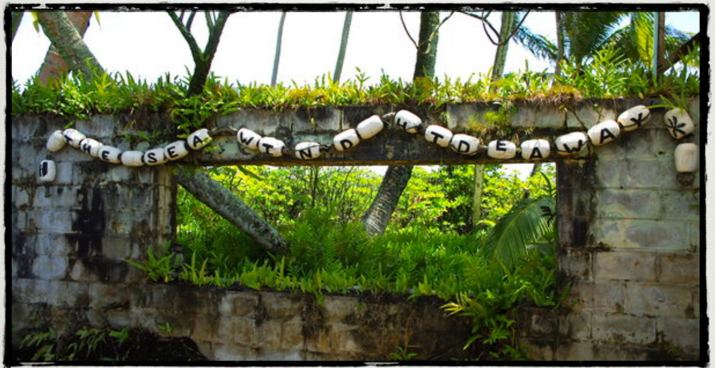
Boat Bumpers from the sea wind still on Palmyra this image was taken in 2014.